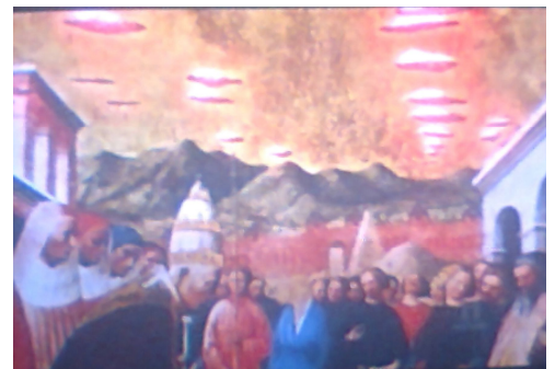
HORDES ~ MEDIEVAL HORDES