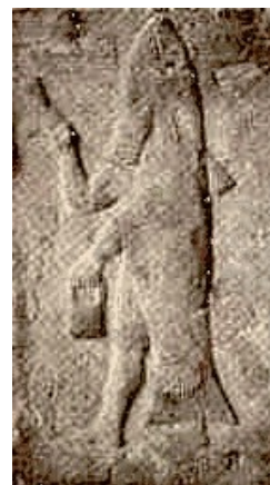
THE SILURID – OANNES ORBS ON THE LEFT AND FLYING CRAFT