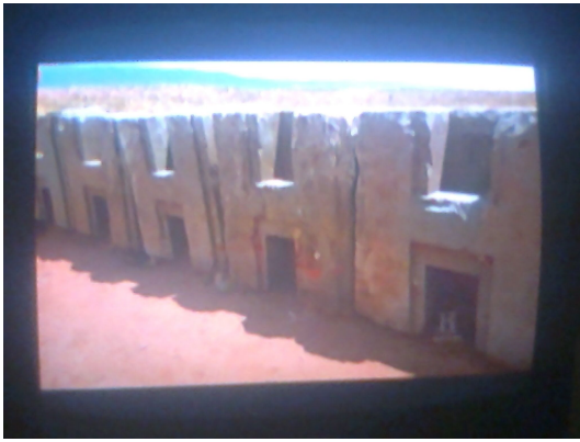
SAFE HOUSES ~ 7000BC