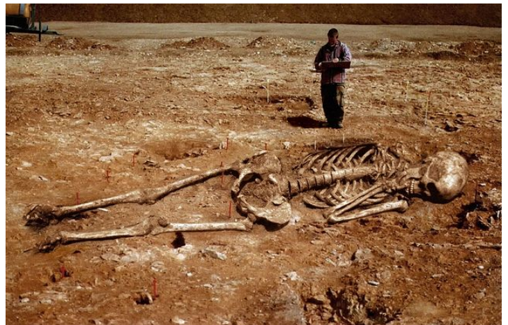
FROM CANAAN TO INDIA - GIANT SKELETONS

AND HAVE YOU NOTICED HOW DARK THE SKY HAS BECOME?