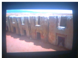
SAFE HOUSES ~ 7000BC

8 20 3 Voix acheptees, de sang chappelle tainte NOTE CHANGE : VENTILATE DEEPEST SEEDS EL VEXATION, TELL NATIVE APACHE HEAP EXOPATHIC APPELLATE visa descent SEPDET LEVITATION E ants devices - devas insect - sect invades sends as active disc event vast ice ends